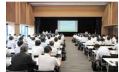
Seminar for the local government employees

For more details, please visit: http://www.ppc.go.jp/en